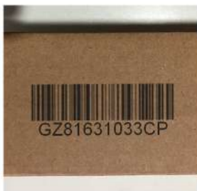
Dynamic security barcode