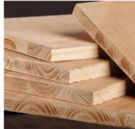
Furniture and wood