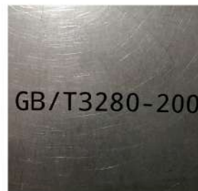
HD bold font