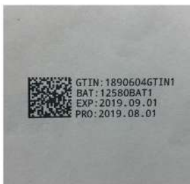
GS1 Data Matrix