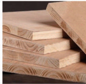
Furniture and wood