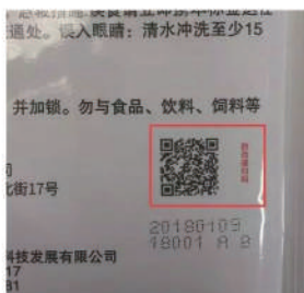
Dynamic trace QR code