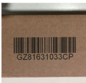
Dynamic security lable