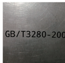
HD bold font