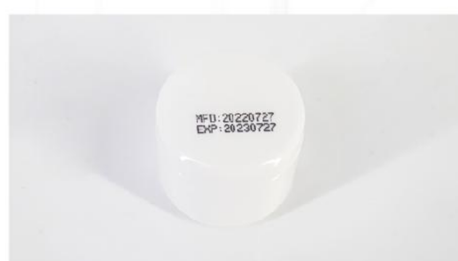
Daily chemical products