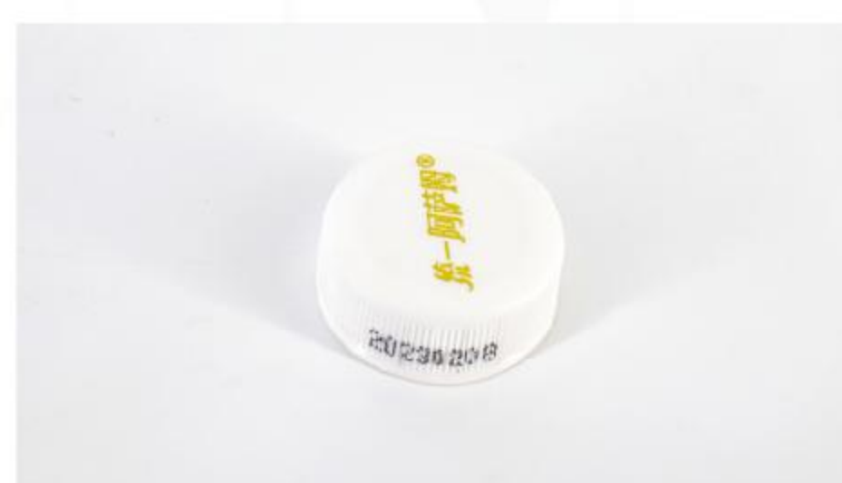
Food and beverage